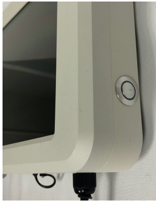
Power Button on side of monitor.